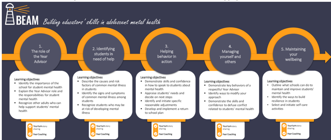
Figure 1. Overview of the Building Educators' skills in Adolescent Mental Health (BEAM) training program.